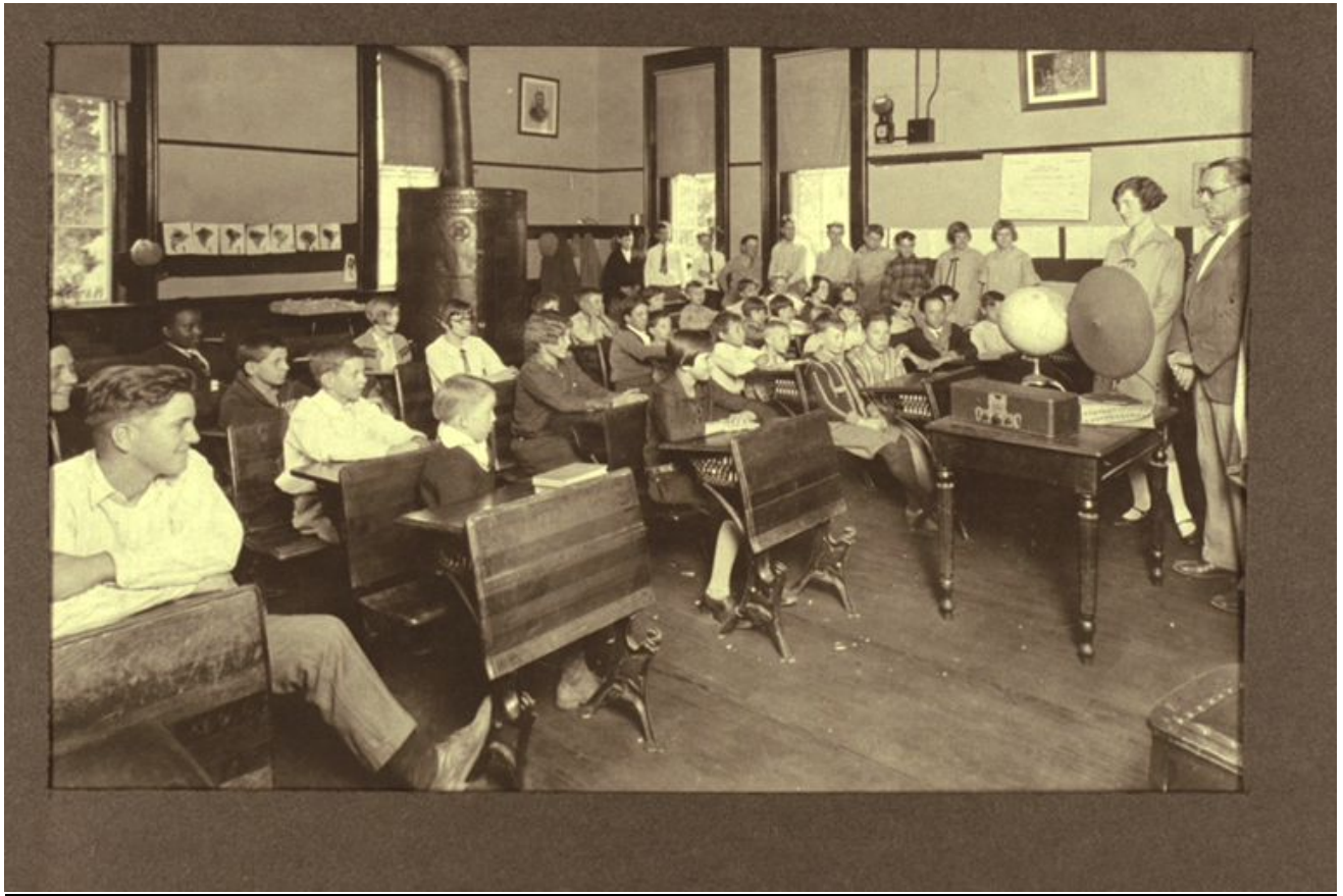
A WRK radio class (school unknown, date unknown)