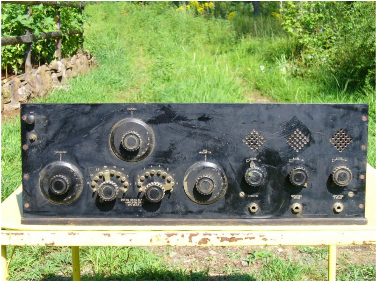
Doron Bros. Electric Company c1920 "Type R.D.2-A" 3-tube battery radio