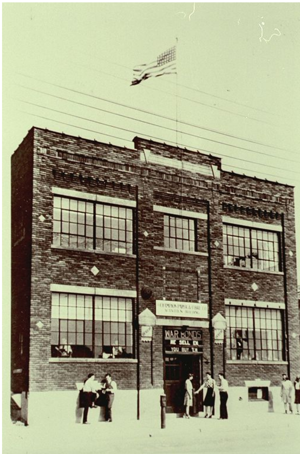
Building built by the Dorons on North B Street for manufacturing radios (later became the Champion Paper Company activities building) (picture circa 1943)