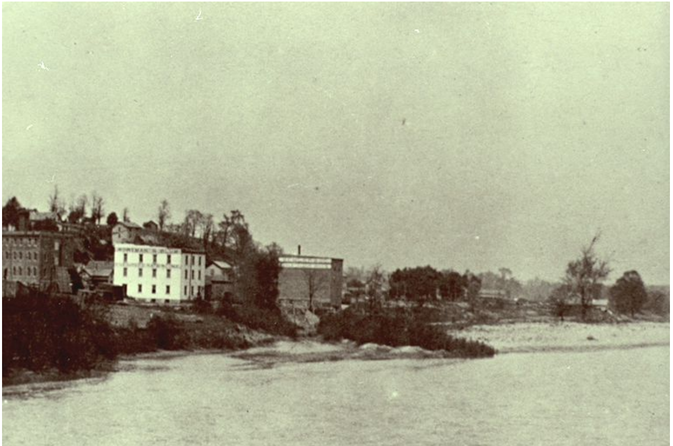
The Doron Bros. Electrical Company's first radio manufacturing shop (white building) on North B St. at Wayne St. in the former Blum & Co. Furniture Factory (204 N B St.) before they moved further north on B Street into another building during 1918 and then moved again further north to the 325-329 North B Street building (see page 4)